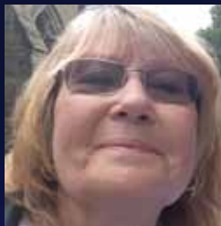
By psychic Chrissie